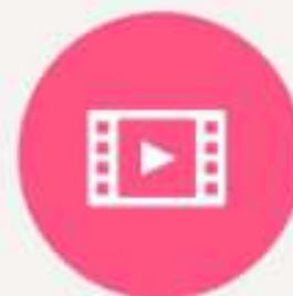
HD Video Transmission