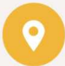
Accurate Position Hold