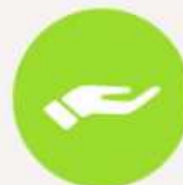
Extra Long Distance Control